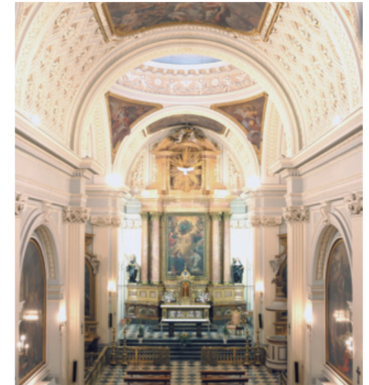
The stunning interior of the convent church

Its classicist design follows the architectural models established by the disciples of Juan de Herrera at El Escorial, and between 1755 and 1775 Ventura Rodríguez decorated the whole interior of the convent church in an exquisite neoclassical style of Roman inspiration.