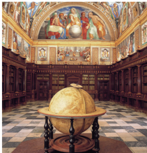
Library of the Royal Monastery of El Escorial

The monument that best embodies the ideological and cultural aspirations of the Spanish Golden Age is the Royal Monastery of San Lorenzo de El Escorial, the most representative building of Philip II's reign, situated in the Sierra de Guadarrama and inscribed on UNESCO's World Heritage List. Some of its most striking spaces are the Courtyard of the Kings, the Basilica (a masterpiece of Spanish Renaissance architecture) and the Hall of Battles, which reflects the might of the Habsburg dynasty.