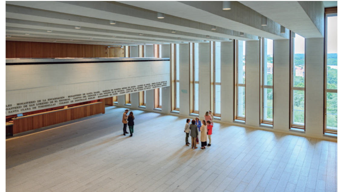
Vestibule of the gallery's main entrance seen from the Plaza de la Armería viewpoint

All of the aforementioned entrances are fully accessible and equipped with spacious reception areas.