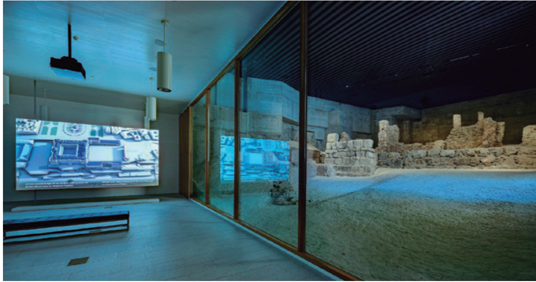
Private dinners can be arranged in the Archaeological Remains Gallery, next to the oldest remnants from the founding of Madrid that have been found to date