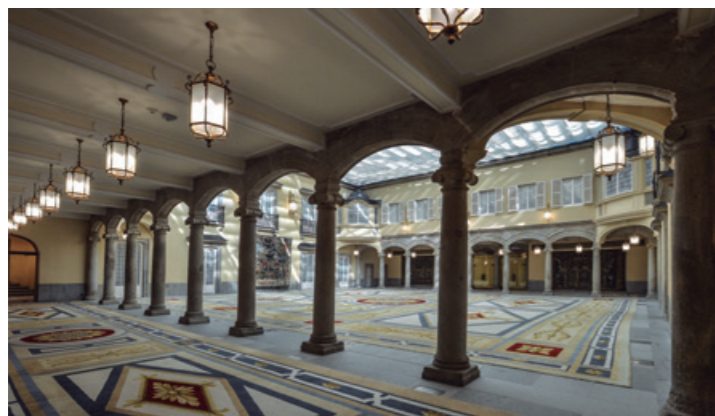
Courtyard of the Royal Palace of El Pardo, official residence of foreign heads of state

Charles V had the palace built in the sixteenth century and left his mark on the crests and emblems that adorn the main entrance and courtyard galleries. The rooms are hung with important tapestry series, woven from cartoons signed by renowned artists like Francisco de Goya.