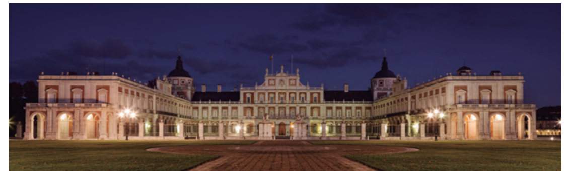
Facade of the Palace of Aranjuez at night

To book, write to: gestionvisitas@patrimonionacional.es