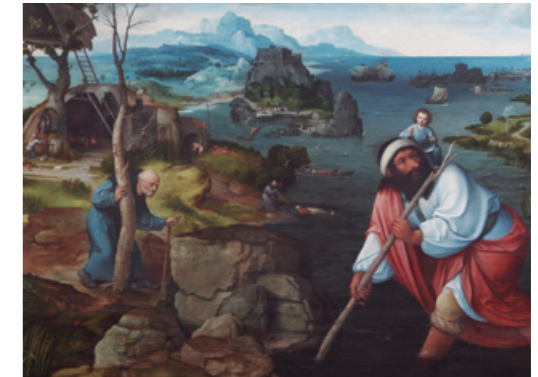
Joachim Patinir, Landscape with Saint Christopher and the Christ Child , about 1521. Oil on panel