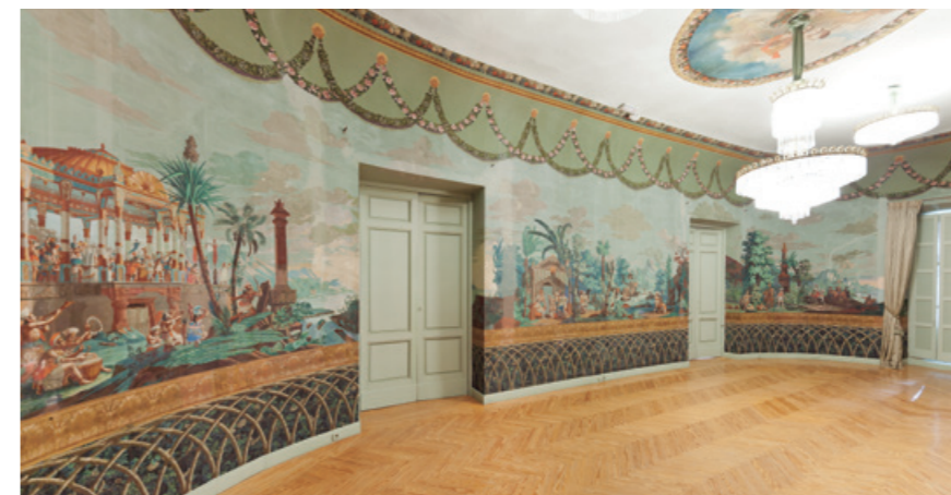
A room inside the Palace of the Villa of the Duke of Arco

To ask about other historic venues for hire, write to: alquilerdeespacios@patrimonionacional.es