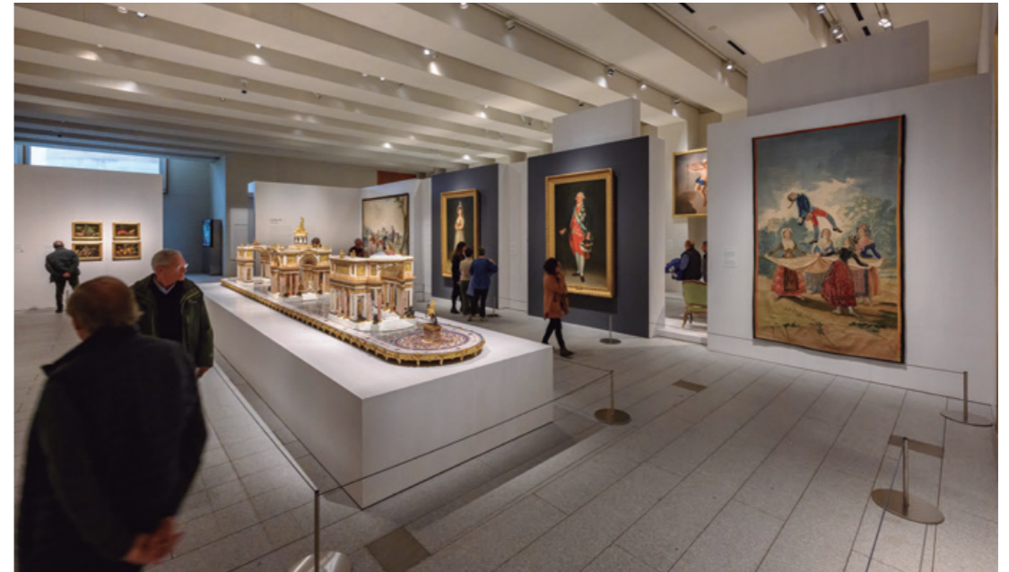
Section of the Bourbon Gallery dedicated to Charles IV, featuring works by Goya

The exhibition narrative then proceeds to illustrate the Pax Hispanica of Philip III and the relevance of Philip IV as a great European patron of the arts and supporter of artists like Rubens, Bernini, Velázquez, Jusepe de Ribera and Caravaggio. The Habsburg Gallery ends with Charles II, who decreed that all artistic assets adorning the royal palaces should remain the inalienable property of the Spanish crown.