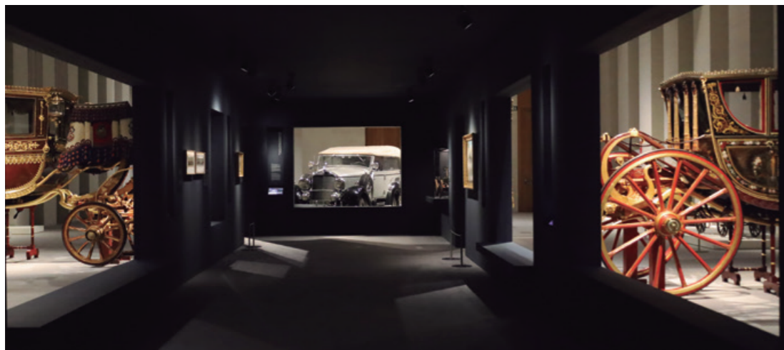
The inaugural temporary exhibition included coaches, carriages, motorcars and sledges, among other pieces

On the last floor of the itinerary (Level -3), the temporary exhibition hall is currently hosting the inaugural show In Motion: Carriages and Other Vehicles in Patrimonio Nacional's Collections .