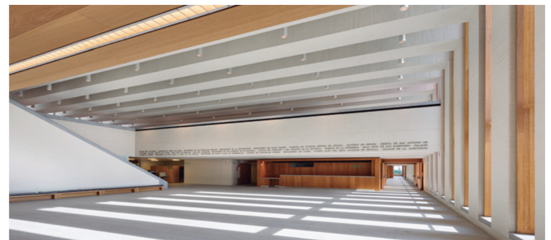
Main vestibule of the Royal Collections Gallery