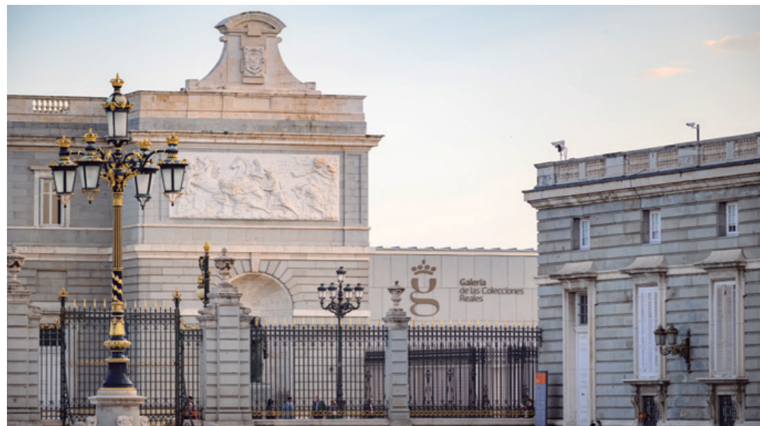
Entrance to the gallery from Plaza de la Armería