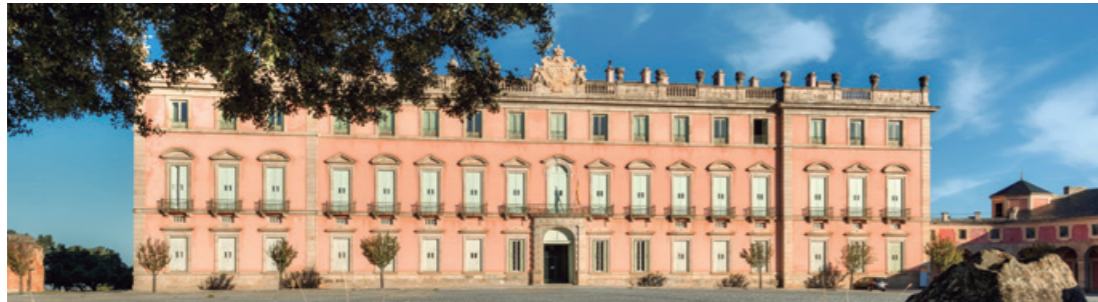
The impressive facade of the Royal Palace of Riofrío

Surrounded by more than six hundred hectares of wooded land with amazing biodiversity, the Royal Palace of Riofrío is one of Patrimonio Nacional's lesser-known gems. The building stands in the heart of the Riofrío forest, a natural enclave of great ecological value just nine kilometres outside Segovia inhabited by more than one hundred different wildlife species.