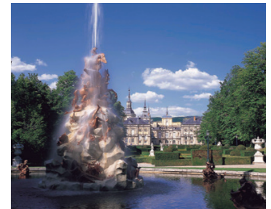
The historical fountains still work today