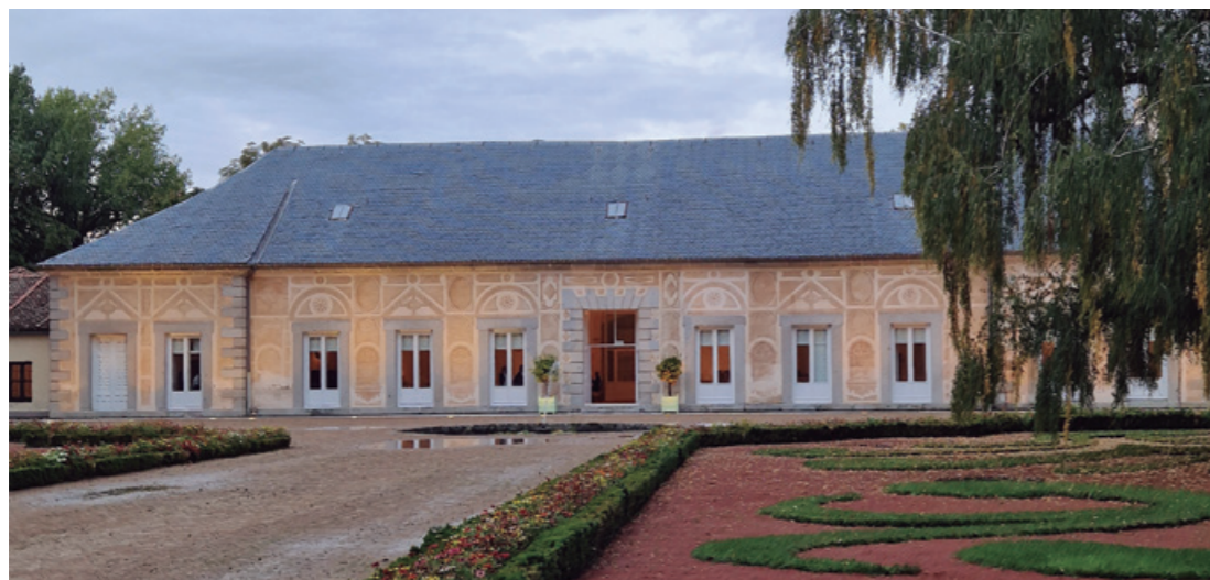
Facade of the Casa de las Flores at the royal site of La Granja de San Ildefonso