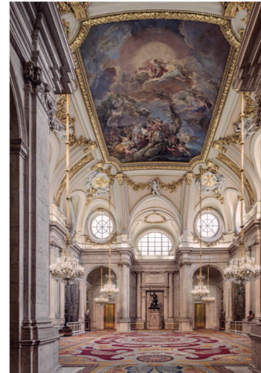
Hall of Columns