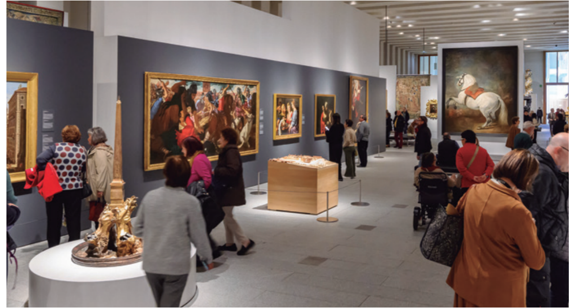
Section of the Habsburg Gallery dedicated to Philip IV, featuring outstanding works by Caravaggio, Bernini, Velázquez and Ribera

All of the royal sites are represented in the gallery, in order to give visitors a general idea