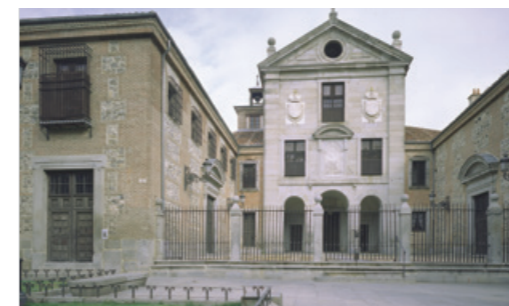
Facade of the Convent of La Encarnación