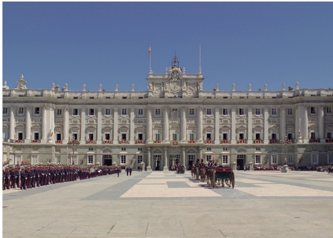
Royal Palace of Madrid. Solemn changing of the guard

of armour kept in its Royal Armoury (the most important in Europe along with the Imperial Armoury in Vienna) or touring the Royal Kitchen takes one back to a spectacular past, although this history exists amid a flurry of present-day activity: the halls and courtyards still host official ceremonies and cultural events such as concerts, poetry evenings, lectures or temporary exhibitions.