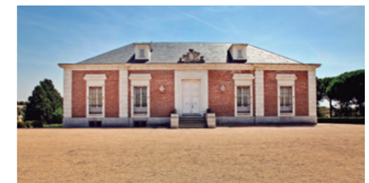
Esplanade before the facade of the Palace of the Villa