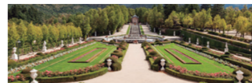
View of the gardens and the Sierra de Guadarrama from the palace

The rich interior décor is complemented by the tapestry museum, which boasts one of the most splendid collections in the world, rivalled only by the one in Vienna.