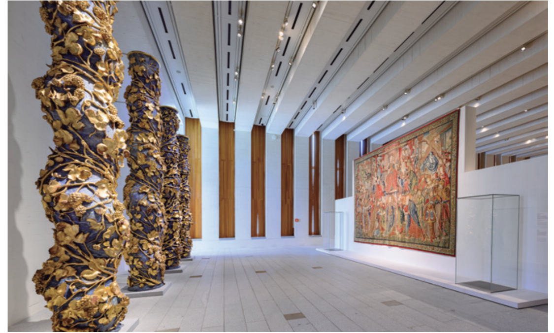
The Habsburg Gallery: Churriguera's impressive Solomonian columns welcome visitors

The gallery building is much more than a container: it is a work of art in its own right, boasting unprecedented vistas of the city of Madrid and a visual connection to the Campo del Moro and Casa de Campo parks, as well as the unique experience of roaming and exploring its interior.