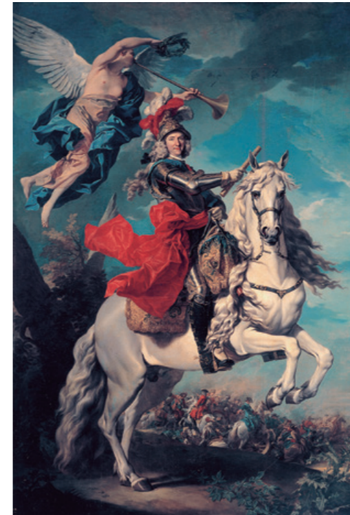
Louis-Michel Van Loo, Equestrian Portrait of Philip V , 1737. Oil on canvas

A guided tour of this astonishing building and its magnificent exhibits, after the museum closes to the public, is a truly unique experience. Here are just a few of the artworks that guests at events held in the gallery will be able to admire.