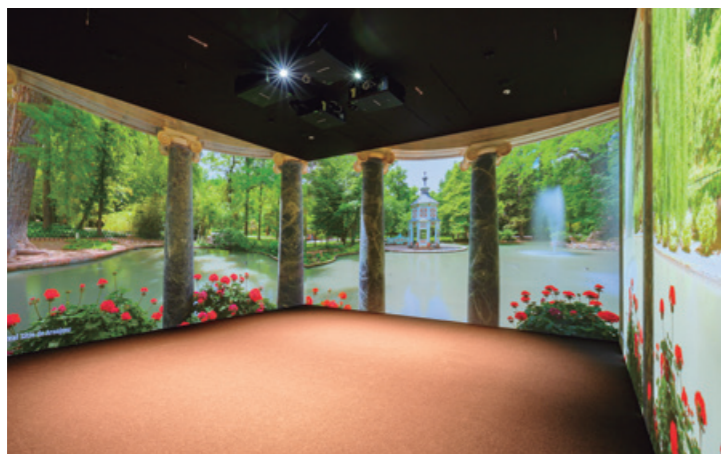
The Cube: a 360-degree audiovisual experience

The Cube shows the various settings that made up the material and symbolic universe of the monarchy, inviting the audience to later visit those royal sites located in different regions of Spain.