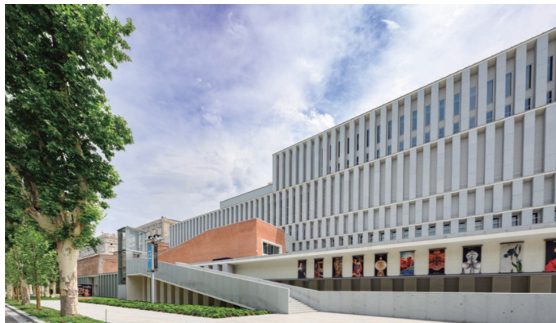
Entrance from Cuesta de la Vega