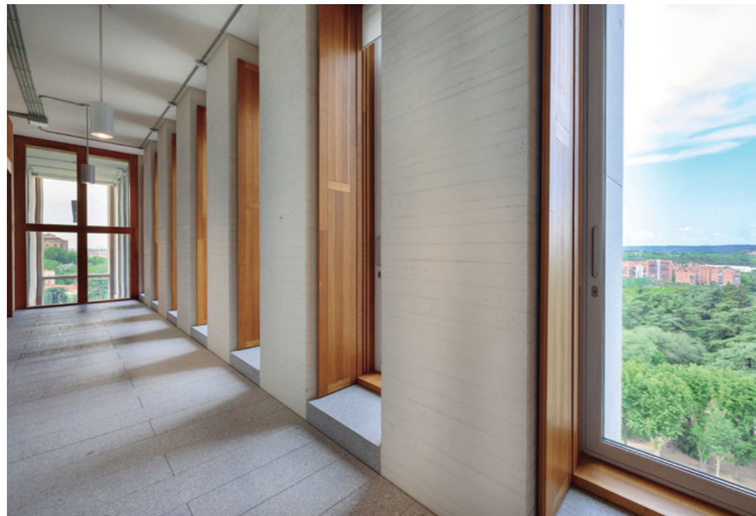
Panoramic views from the gallery

It is an undeniably contemporary creation, at once a paragon of simplicity and understatement and a daring architectural feat, as it supports the heights of Madrid with an immense retaining wall. The facade consists of reinforced concrete columns with granite slabs lining the exterior. The interior is a surprise for several reasons, chief among them its ample spaces, abundant sunlight and views of the landscape. From the entrance by the Royal Palace, one would never imagine the colossal size of the halls inside, with ceilings that soar as high as eight metres above the floor on some levels.