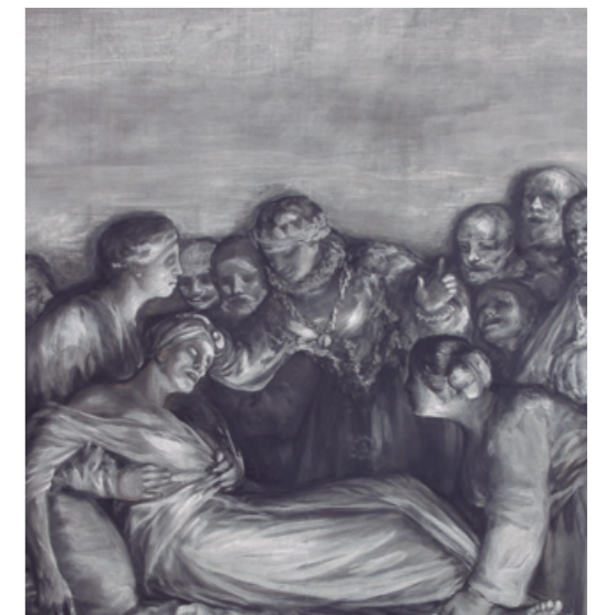
Francisco de Goya, Saint Elizabeth of Portugal Healing a Sick Woman , 1816. Grisaille in tempera on twill-weave canvas