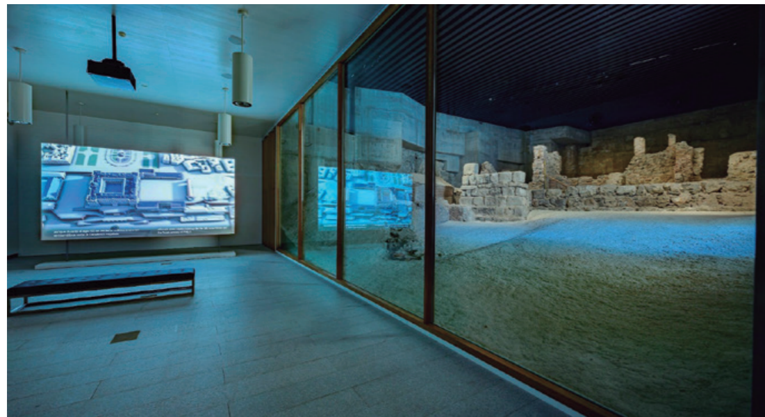
Archaeological Remains Gallery

Every Habsburg ruler added to the collection of tapestries and, from Charles V, that of weapons and armour, with pieces attesting to the emperor's triumphant image. In the area dedicated to Philip II, the founding of the Monastery of San Lorenzo de El Escorial is a highlight.