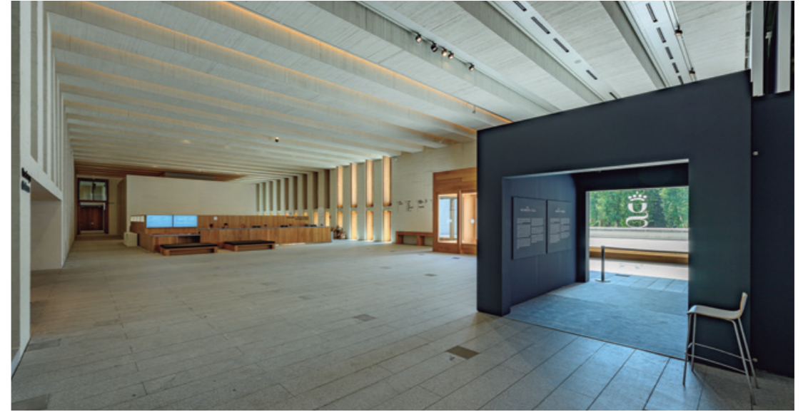
The vestibule on Level -3 is ideal for summer events, as it opens onto the terrace overlooking the Campo del Moro Gardens