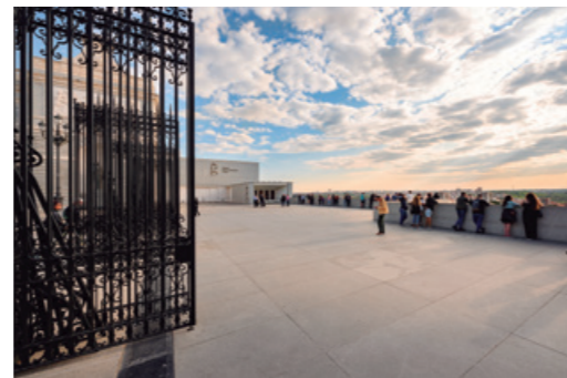
Entrance from the viewpoint in Plaza de la Armería

stroll through nature before or after exploring the Royal Collections Gallery (which can be entered from the gardens), although the park does close at dusk.