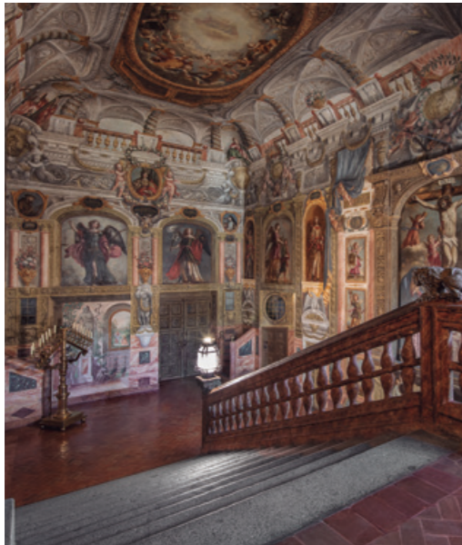
The convent's spectacular staircase

Located in the heart of Madrid, the Convent of Las Descalzas Reales was founded by Joanna of Austria, youngest daughter of Emperor Charles V and princess of Portugal, who wanted to turn the palace where she had been born into a nunnery of Poor Clares. She made it her home upon returning from Portugal, and her body rests in the chapel that occupies the same space where she first came into the world.