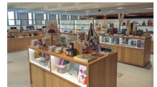
One of the gallery's shops

Diego Rodríguez de Silva y Velázquez, White Horse (1634–1638). Oil on canvas ➔